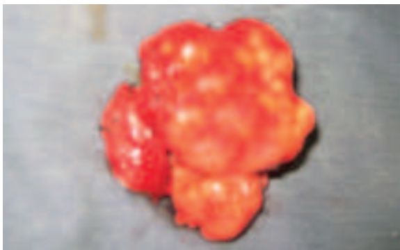
Fig 3: Gross specimen showing a well encapsulated mass