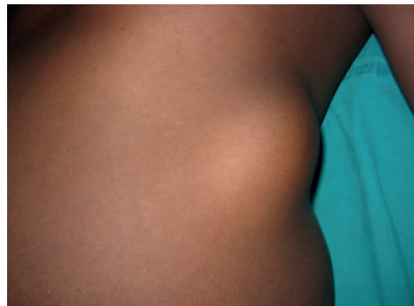
Fig1: Clinical picture of left chest wall swelling

Ultrasound revealed a large well defined 8x4.1x3.7cms size, mixed echogenic - predominantly hypo echoic mass along the lateral aspect of lower chest in the muscle plane and superficial to ribs suggestive of soft tissue tumor.