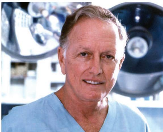
Fig 1 : Dr.Denton A.Cooley