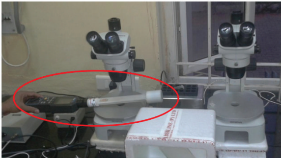
Fig 2: Field strength meter used to measure the power density.

Compared to the control group, there was 7.6% decline in mean percentage of progressively motile sperms in the group exposed from the back of the mobile, which is statistically significant (95% CI -11.74 to -3.45, p value 0.001). There was a slight decline of 0.83% in the mean percentage of non progressive sperms. The mean percentage of immotile sperms had increased by 8.4%, which was statistically significant (95% CI 4.48 to 12.31, p value 0.00). (Table 4)