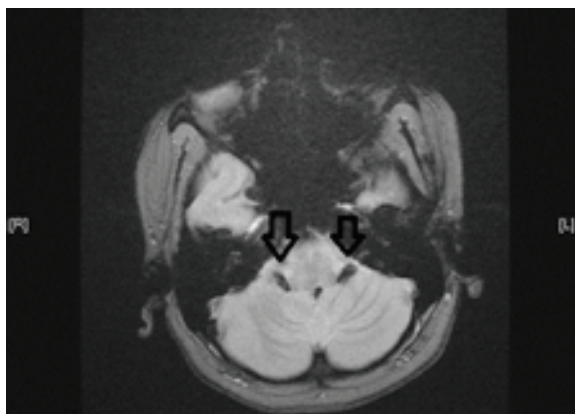
Fig 2 - MRI Brain – GRE image showing hypointensity of Foramen of Luschka

Haemochromatosis can be of two types Primary or Hereditary Haemochromatosis(HH) which is due to a HFE gene defect or a non-HFE mutation like haemojuvelin, Hepsidin, Transferrin receptor mutations. In secondary haemochromatosis the iron excess is due to conditions like congenital haemolytic anaemias, environmental and lifestyle factors.