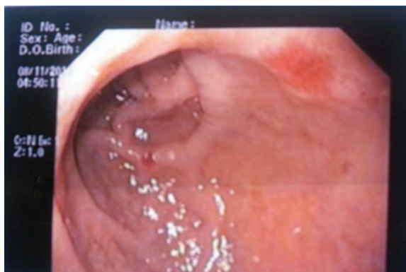
Fig. 4 - Gastric Vascular Ectasia