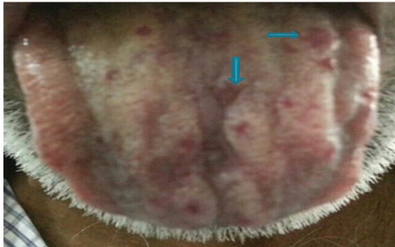
Fig. 3 - Tongue Telangiectasias