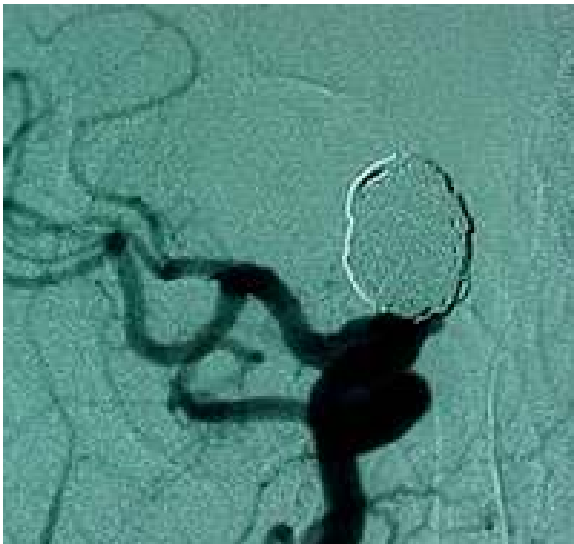
Fig 3: Coiled ICA aneurysm

The goal of endovascular coiling is to fill the aneurysmal lumen with Guglielmi Detachable Coils (GDC) which then initiates secondary thrombosis of the aneurysm. These are soft platinum coils which are placed inside the aneurysm. The coils are threaded through a micro-catheter placed in the aneurysmal lumen through the femoral artery. If the aneurysm is amenable to both clipping and coiling, coiling should be preferred. Elderly patients, patients with poor WFNS grades (IV and V) and those with a basilar top aneurysm benefit from endovascular coiling 20 . Broad necked aneurysms may be managed with balloon remodelling