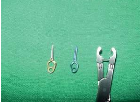
Fig 1: Aneurysm clips and applicator