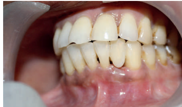
Fig 3: Post operative facial view of rehabilitation of missing tooth with Periodontal splinting

Composite pontic was prepared on to the facial aspect of already cured fiber band in the edentulous space. Additional composite resin was applied to blend the FRC contours and light polymerized. Incisal adjustments were accomplished and final finishing and polishing done (Figure-3). Routine oral hygiene instructions were given, the patient was evaluated every 6 months for review and periodontal therapy was observed to be effective in obtaining optimal oral health. Periodontally compromised abutment teeth exhibited signs of periodontal health, patient was highly satisfied with aesthetic and functional outcome of the treatment.