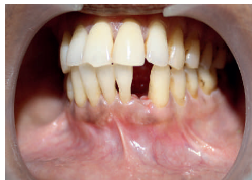
Fig 1: Preoperative view of missing left lateral incisor due to advanced periodontitis

A 47 year old lady reported to the department of Periodontics, Chettinad Dental College & Research Institute Chennai, with the chief complaint of unaesthetic appearance and discomfort during function, associated with the mandibular anterior teeth. Patient had lost mandibular left lateral incisor due to advanced periodontal disease (Figure-1). Clinical and radiographic examination revealed that the patient had maximum intercuspal position, moderate bone loss with Grade I tooth mobility in mandibular anterior teeth (according to the Miller index for tooth mobility).