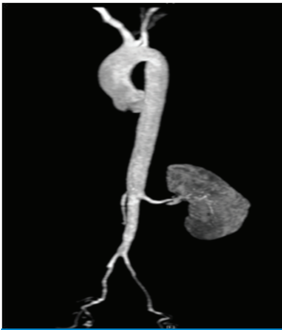
Fig 3 - MR Angiogram - Poor visualisation of bilateral internal & external iliac arteries