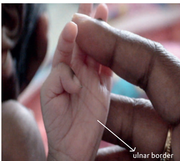
Fig 2: Illustration of Sydney Crease - Two transverse creases extending to ulnar border

There are also reports of Sydney crease in Williams Beuren Syndrome, Fragile X-syndromes, Marfans, Rubeinstein Taybi Syndrome, and Achondroplasia In a follow up study the Sydney crease disappeared in 58.8% of infants by 10 months of age 17 .