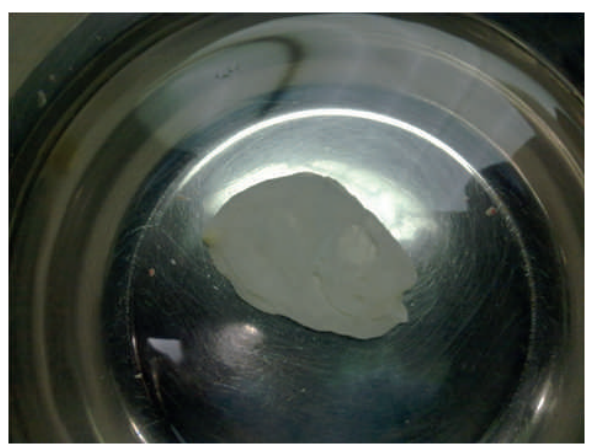
Fig 3: Resected Cyst along with worm

That too occurring with background of Combine Immunodeficiency has not been reported so far.