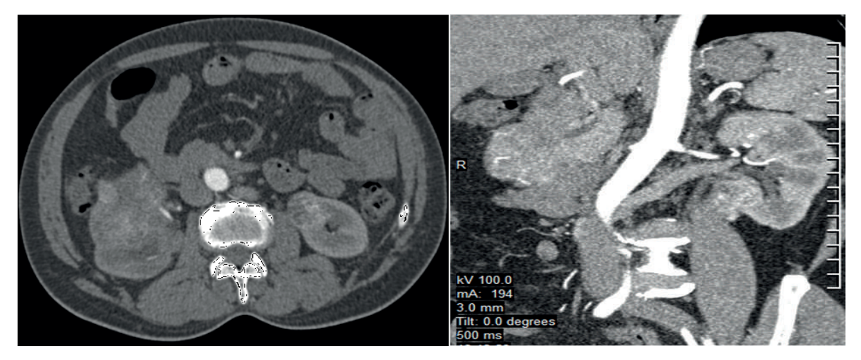
Fig. 2,3 - CECT abdomen showing a mass lesion in the upper pole of right kidney and lower pole of left kidney

Figure 1f – Section shows Fuhrman nuclear grade III in clear cell type of renal cell carcinoma, Hematoxylin and Eosin stain, x 400