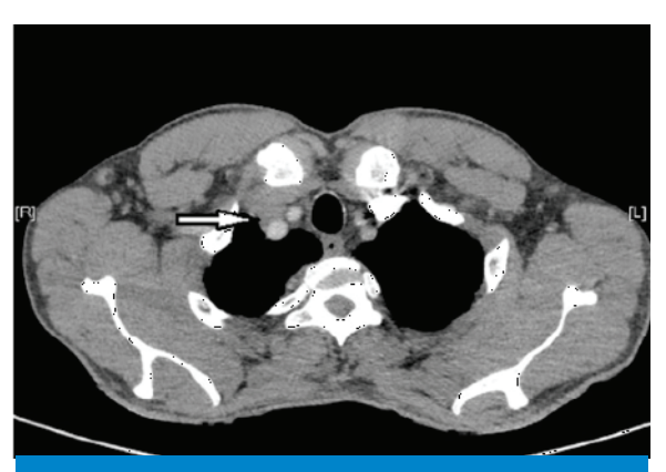
Fig 4 : Computed Tomography of the chest showing mass lesion

of trachea. Multiple large subpleural bullae were also noted along with a few enlarged right upper and bilateral lower para tracheal lymph nodes.