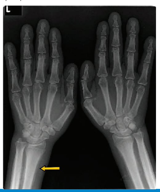
Fig 2 : X-Ray of the hands showing periosteal reaction

Radiographs obtained of the hands, wrists and long bones (Fig 2) showed extensive periosteal reaction, consistent with hypertrophic pulmonary osteoarthropathy.