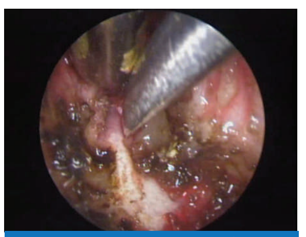
Fig 4 : Showing Showing Delineation of Odontoid Process

The odontoid process compressing the spinal cord was freed from the surrounding soft tissue attachments and drilled out by diamond burr leaving a thin plate of bone overlying the thinned out cruciate ligament and spinal dura. The residual egg shelled thin odontoid process was dissected from the spinal dura (Fig 4) till dural pulsations were encountered.