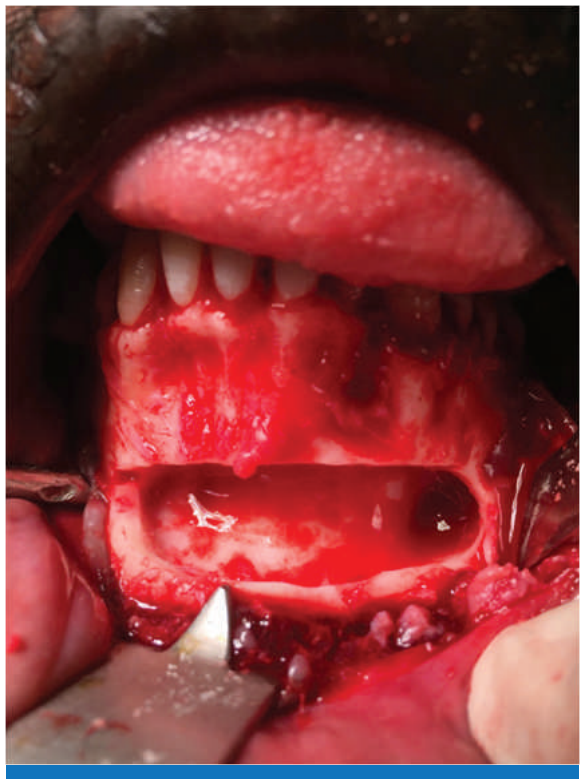
Fig 4: Intra operative photograph after complete cyst enucleation.

Intra operatively crevicular incision from 36 - 46 was given and envelope mucoperiosteal flap raised. The buccal plate was intact and hence we created a bony window for cyst enucleation wherein copious caeseous material was aspirated confirming the probability of OKC. Hence cyst enucleation in toto followed by peripheral ostectomy and chemical cauterization of the cystic cavity with freshly prepared Carnoy's solution was done (Fig 4). Cavity was closed with betadine soaked ribbon gauze.