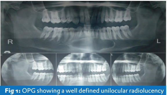
of about 5×6 cm with sclerotic borders extending approximately from apical surfaces of 36-45.

On extra oral examination, a mild diffuse swelling with no definite borders, confined to the chin region was found. On intraoral examination, lower anterior labial sulcus was mildly obliterated with the swelling firm in consistency and interspersed with few soft areas. EPT of teeth from 36 - 46 was done and 31,33,35,36,45 found to be non-vital. Aspiration of the lesion from soft areas yielded bloody fluid.Preliminary investigation of Ortho Pan-Tomogram (OPG) revealed a well defined unilocular radiolucency of about 5×6 cm with sclerotic borders extending approximately from apical surfaces of 36-45 (Fig 1).