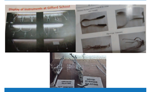
Fig 3: Instruments at Gifford school