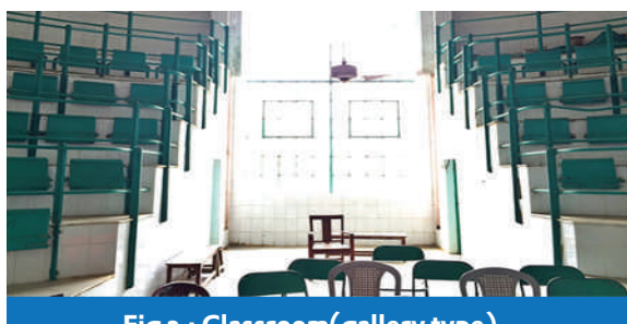
Fig 2 : Classroom(gallery type)

the museum possesses around 200 ancient Obstetrics & Gynecology instruments from 16th century and around 200 rare specimens (Fig 4). This Gifford school is a 'Heritage Site', as declared by the heritage conservation committee. I had a great opportunity to visit the museum when Dr. Radhabai Prabhu invited us. I wish all medical students and medical fraternity could visit this place.