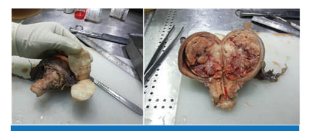
Fig 1 : specimen of total abdominal hysterectomy showing polypoidal tumor mass in uterine cavity with haemorrhagic and necrotic areas.