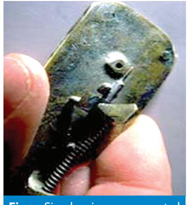
Fig 2 - Simple microscope created by Leeuwenhoek