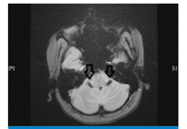
Fig 2 - MRI Brain – GRE image showing hypointensity of Foramen of Luschka

Haemochromatosis can be of two types Primary or Hereditary Haemochromatosis(HH) which is due to a HFE gene defect or a non-HFE mutation like haemojuvelin, Hepcidin, Transferin receptor mutations. In secondary haemochromatosis the iron excess is due to conditions like congenital haemolytic anaemias, environmental and lifestyle factors.