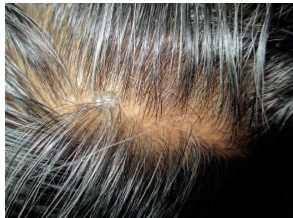
Fig 1 - Hyperpigmented verrucous plaque on the scalp

On examination well demarcated erythematous and hyperpigmented verrucous papules of 0.5-2cm with yellowish plug were seen on the left parietal scalp. (Fig. 1 & 2)