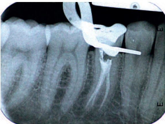
Fig 1 C - Obturation done with Guttapercha and AH PLUS sealer