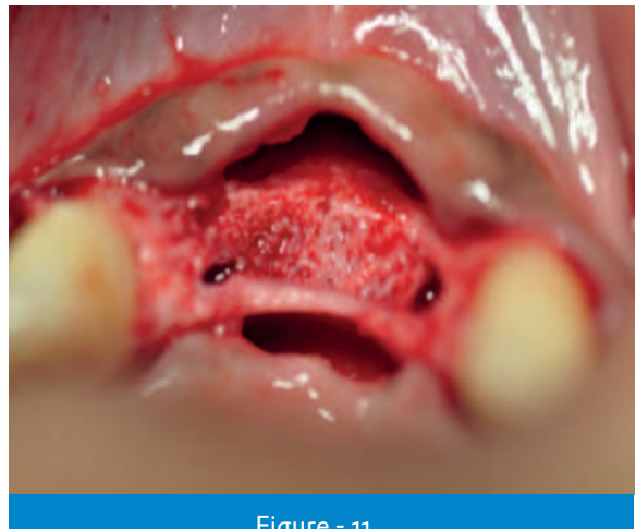
Figure - 11