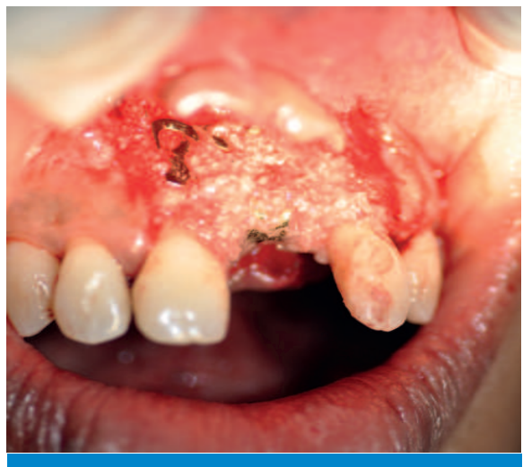
Figure - 8

PRF was prepared following the protocol developed by Choukroun et al8. The procedure of PRF preparation consisted of withdrawing 10 ml of intravenous blood from the antecubital fossa. The blood was transferred into 10 ml sterile tube without anticoagulant and immediately centrifuged at 3000 rpm for 10 minutes. Fibrin clot formed in between the acellular plasma on top and the red blood cells at the bottom was separated using sterile tweezers and scissors. The PRF membrane is placed over the titanium mesh and black silk 3-o sutures were placed. (Fig 9 & 10)