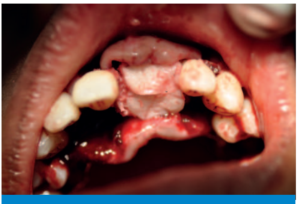
Figure - 9

Subsequently healing collars were placed after 6 months. After obtaining a sufficient emergence profile, impressions were made and the final prosthesis was given.(Fig 15)