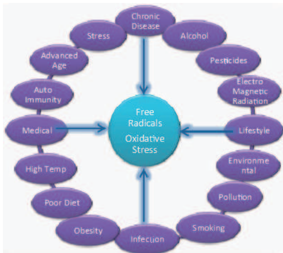
Fig 1 : Source of free radicals and oxidative stress

Free radicals also serve a physiological function. Reactive oxygen species (ROS) are produced during a variety of biological processes. These molecules in small concentrations are essential for cell growth, differentiation or proliferation. They are involved in physiological processes such as signal transduction, regulation of protein kinases or transcription factors 7 . They also regulate redox balance, immune responses, activate macrophages and neutrophils. Cell adhesion and relaxation of smooth muscle are controlled by free radicals. Reactive Oxygen species are essential for apoptosis 7 . These molecules are very important for the correct function and life of the cell 8 .