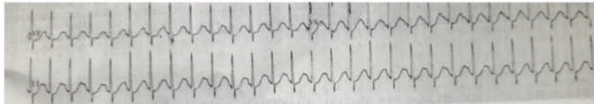
Figure 2 - Rhythm Strip Showing Junctional Tachycardia